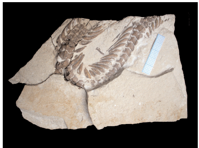
Fig. 2. Pachyostotic snake (Pachyophiidae NHMBEO MV 280) from Bosnia and Herzegovina.